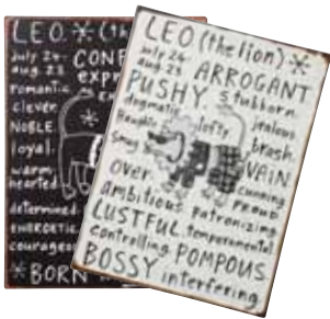
Boast Home Gift Sytle Leo 'Flattering' and 'Not so flattering' star sign $29.95 each