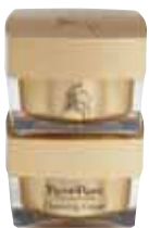
RoopRani RoopRani Gold rejuvenating cream & Gold cleansing cream $35 each