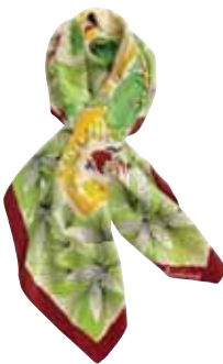
American Rag Vintage silk scarf $45