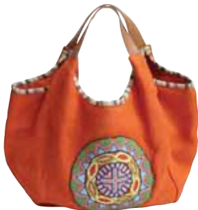
Orígen Zoda bag mayan orange $119