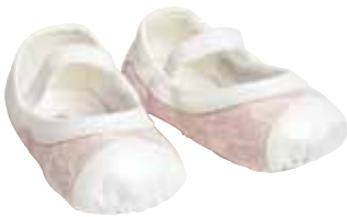
Bloch Baby bloch $40