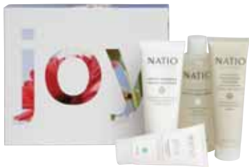
Southgate Pharmacy Natio 'Fresh Face' $29.95