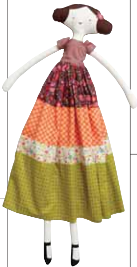
Mary Martin Bookshop Nina french rag doll $89.95