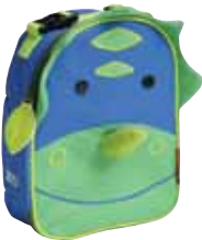
Aero Plus Dino lunchies $24