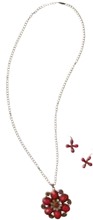
Aqua J Earrings $60, Necklace $95