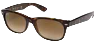
Eyes on Southgate Ray-Ban sunglasses $139