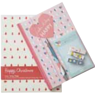
Kikki.K Make Today Happy pack $39.95