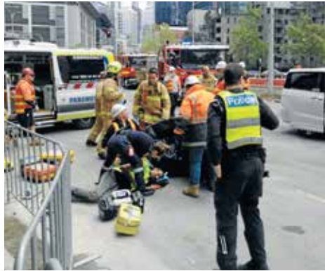
(Left) Paramedics attend to an injured worker and (right) a car damaged from the explosion.