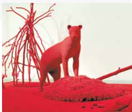
Taking a chance on love, 2003.