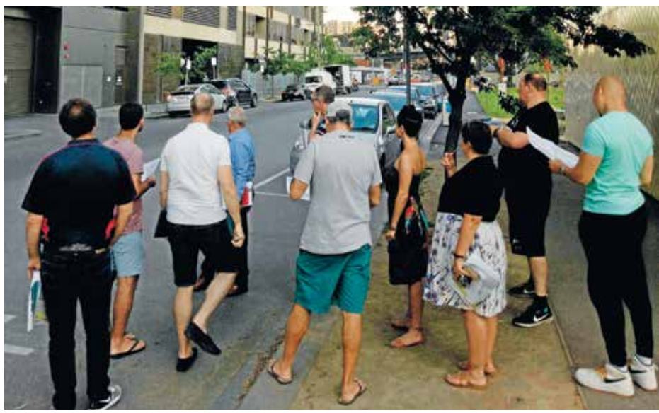
Local residents are shown the proposed parking changes in Balston St last month.