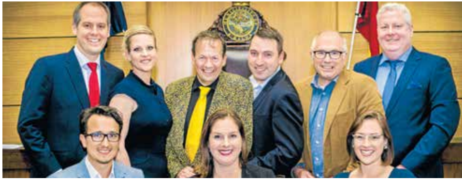
City of Port Phillip councillors have joined the global fight against nuclear weapons.