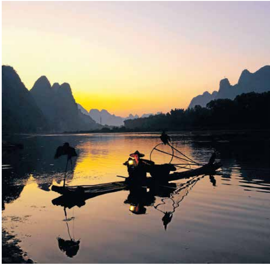
Lantern-lit cormorant fisherman.