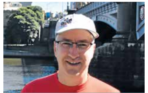
CAM, 52, COMMERCIAL PROPERTY WORKER

I just love the whole set-up. It reminds me a bit of the south bank in London. It's a lovely walk, there's plenty to look at and plenty to eat - if you've got a big wallet!