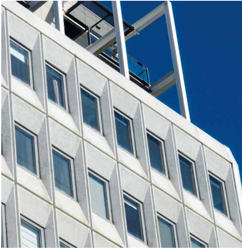
Southside Towers; formerly home to IBM's original offices in Melbourne.

Melbourne's turn came in 1974 when the world's leading mainframe computer company leased a building on the corner of Sturt and Coventry streets in Southbank, on the site of a former knitting mill. Beneath its large IBM neon sign, it included facilities for a large mainframe, processing of data, display of hardware, hundreds of terminal lines, and education services. Special