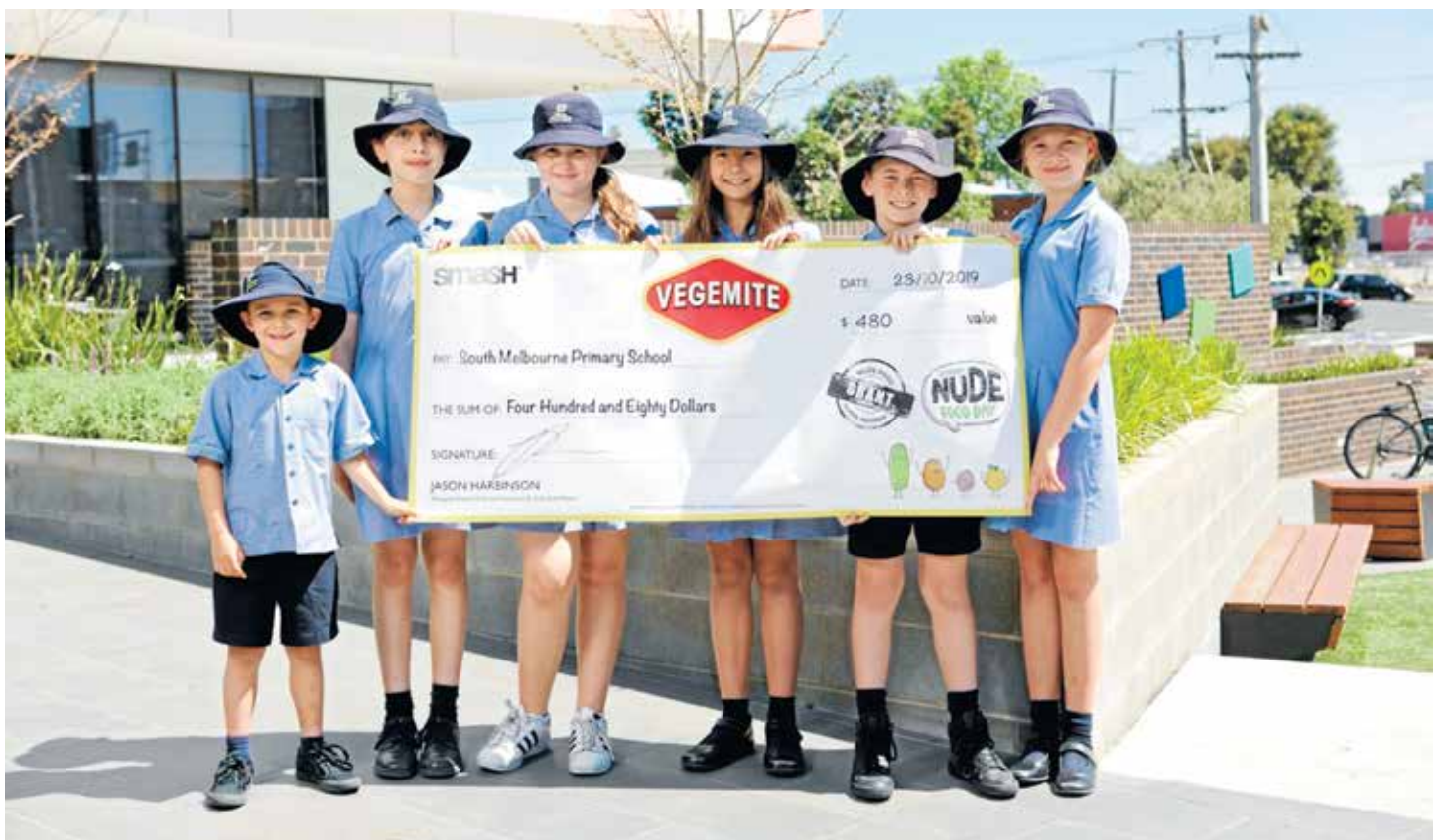
South Melbourne Primary School students were presented with a cheque last month which will help the school fund a new composting program.