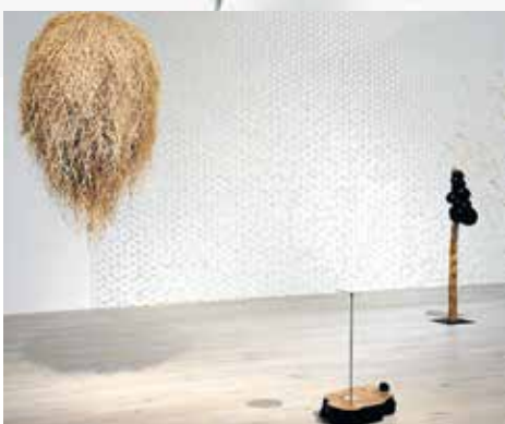
Hiding in plain sight (witch grass nets).