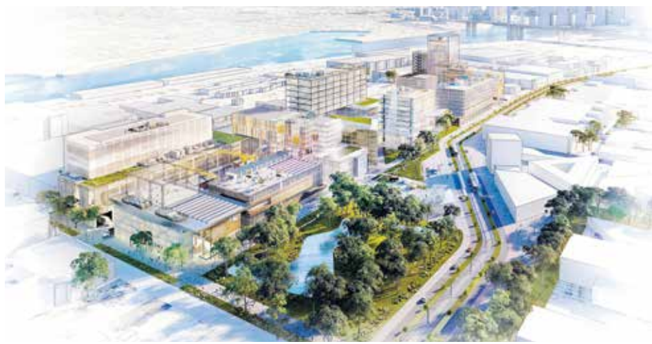
Artist impressions of the University of Melbourne's future campus at Fishermans Bend.

here in Melbourne, working with industry on cutting-edge research and development to design and engineer solutions for some of the world's greatest challenges."