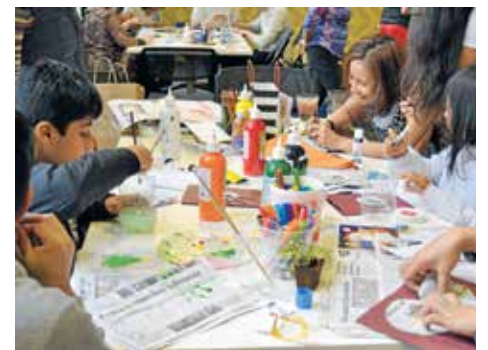
Upcycling educational workshop at Boyd: making beautiful, festive zero waste gift bags, labels, cards, and bon bons, using common household items.

While October was a month focused on gardening and caring for the new spring seedlings in the community garden, we identified an unexpected need. With the Woolies seedling promotion running, we've had a lot of requests from people wanting to plant their own little seedlings in the garden.