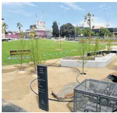
Boyd Park is nearing full completion.

I tried to obtain a copy of the tender documents for the Boyd Park development before any companies had submitted any responses, and before the tender had closed. However, I was told they were not available